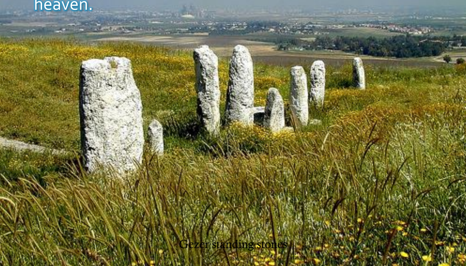
Gezer standing stones

Let your light so shine before men, that they may see your good works and glorify your Father in heaven.