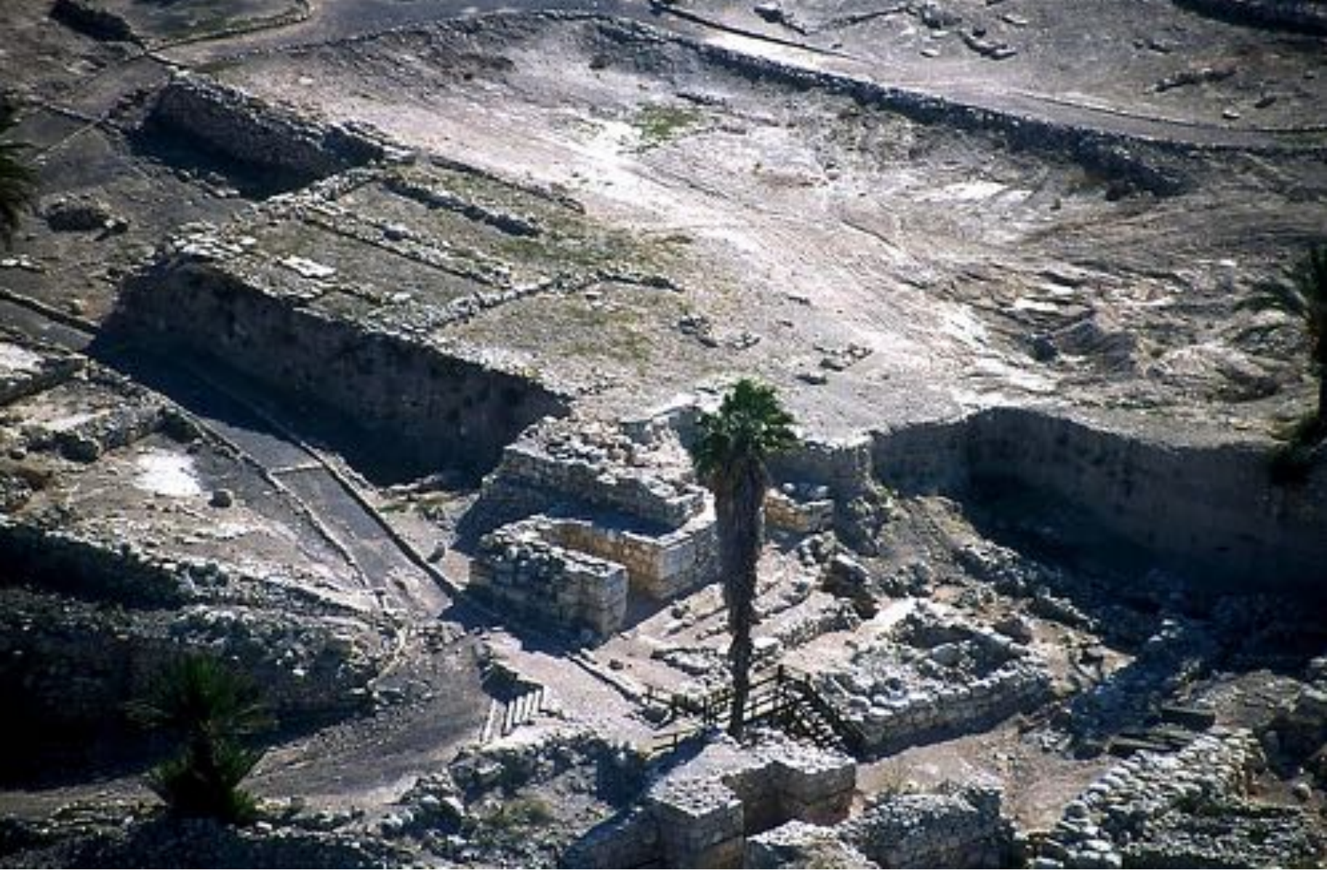
Megiddo Solomonic Gate aerial