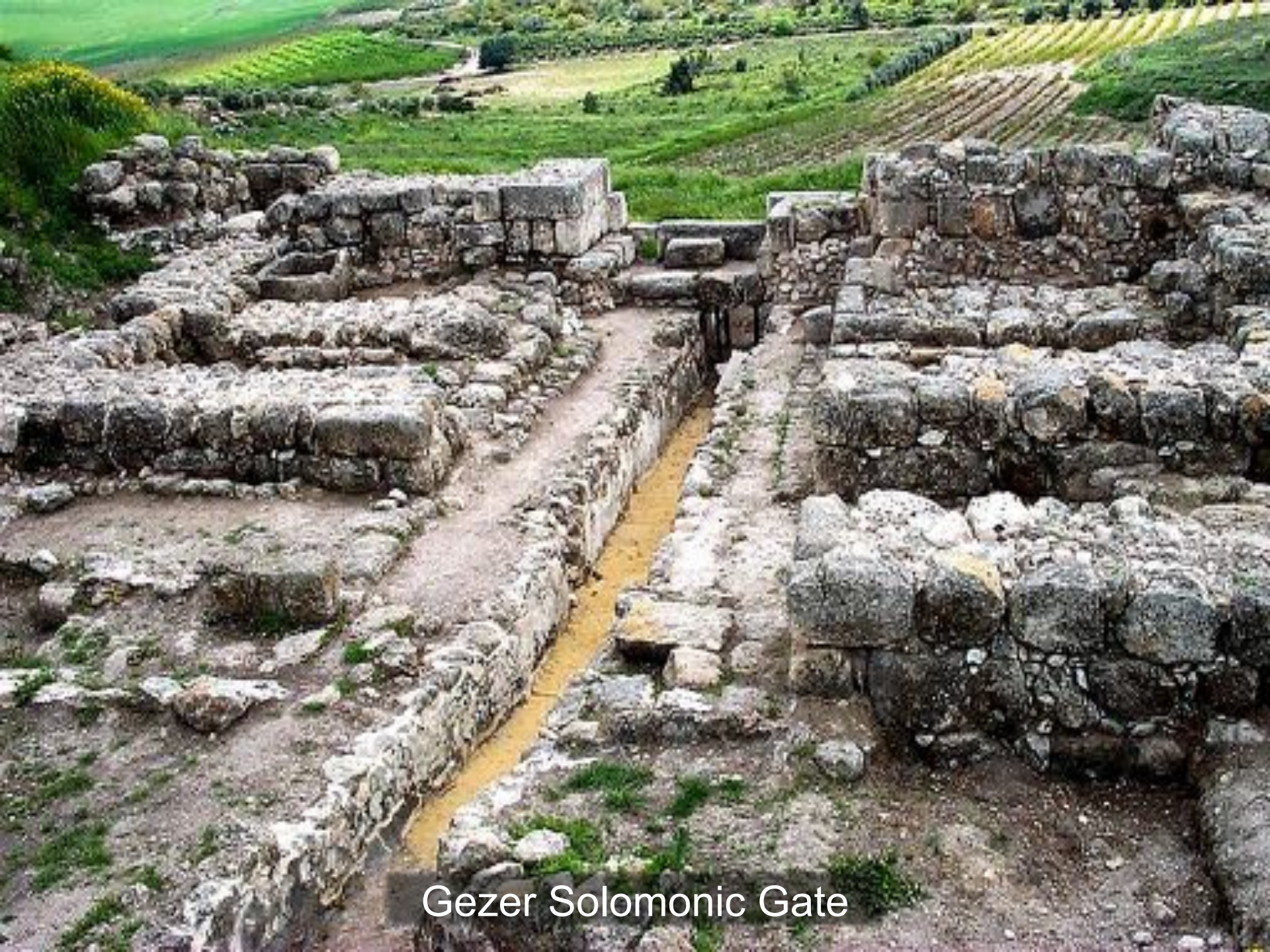
Gezer Solomonic Gate