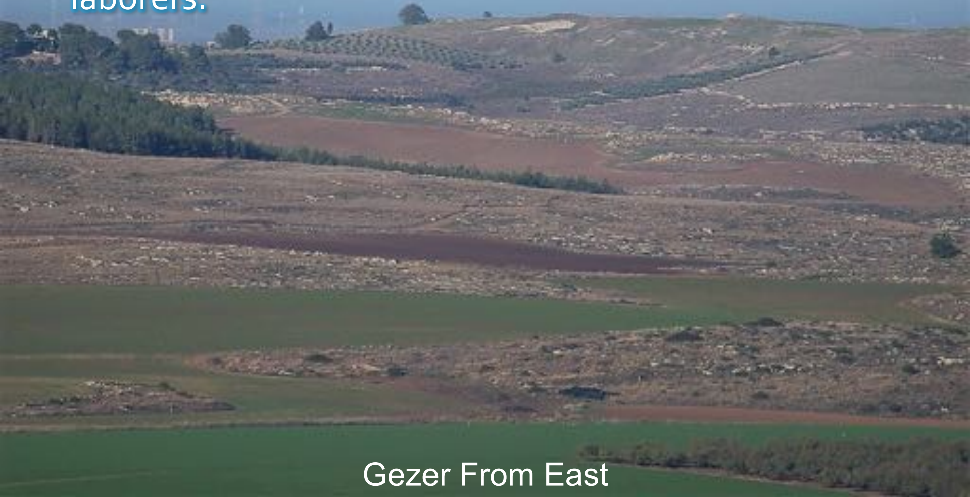
Gezer From East

And they did not drive out the Canaanites who dwelt in Gezer; but the Canaanites dwell among the Ephraimites to this day and have become forced laborers.