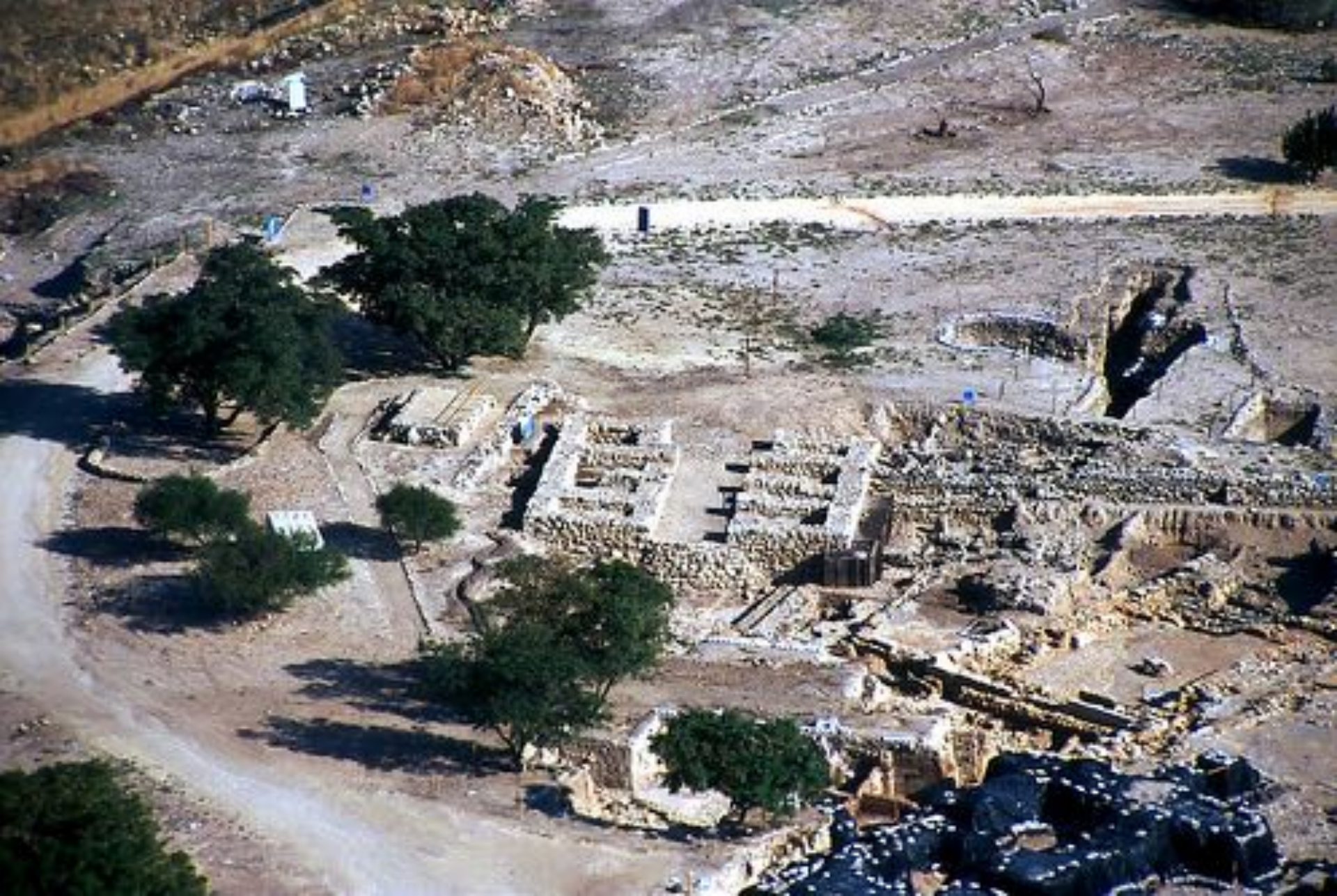
Hazor Solomonic gate aerial from west