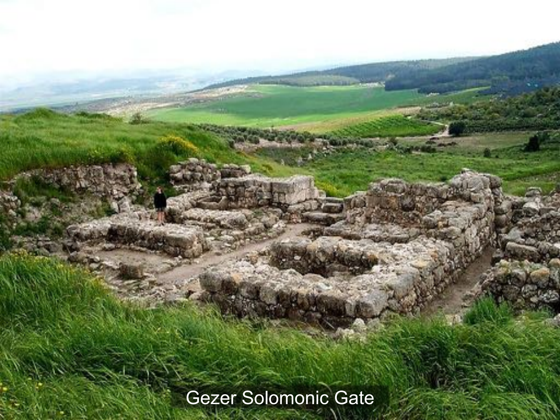
Gezer Solomonic Gate