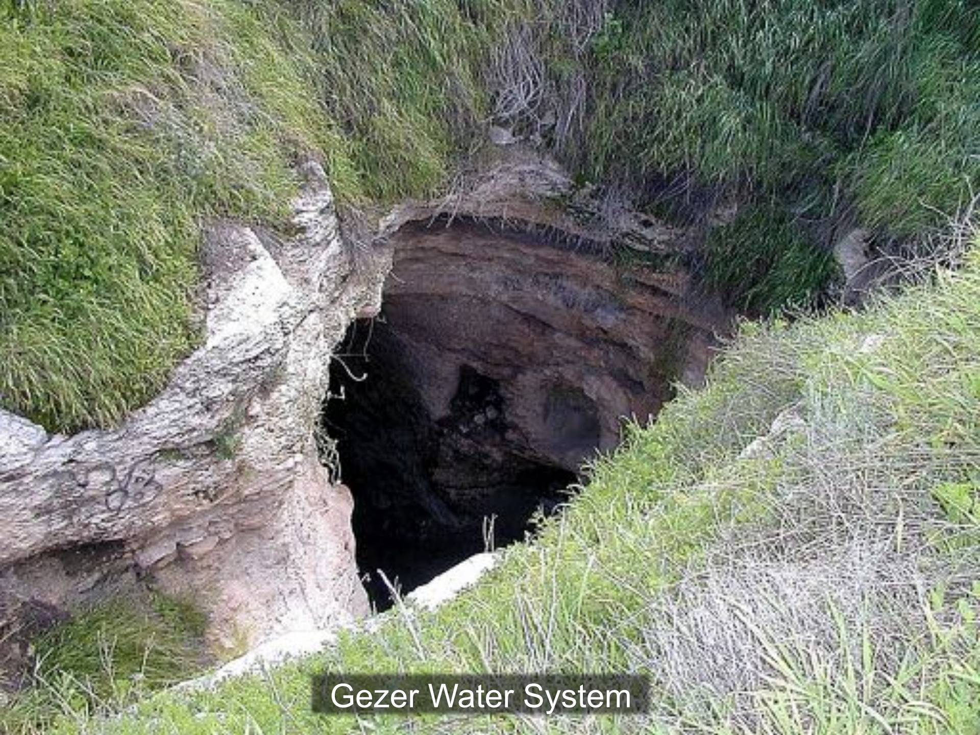
Gezer Water System