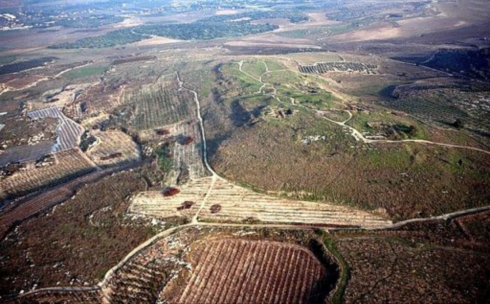
Gezer Aerial From West