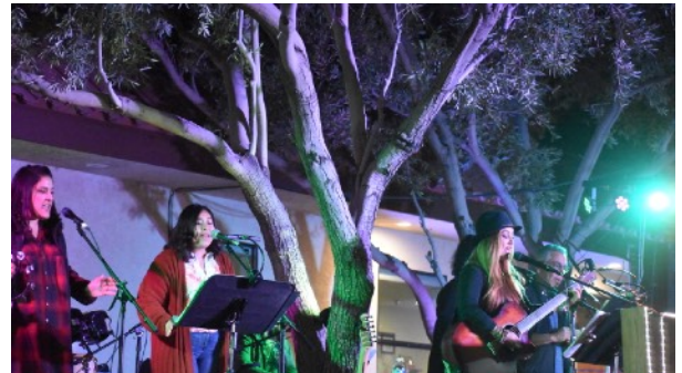
SO BLESSED TO HAVE FUENTE DE VIDA FROM CALVARY CHAPEL CHINO VALLEY SHARING AT THIS YEAR'S HARVEST FESTIVAL