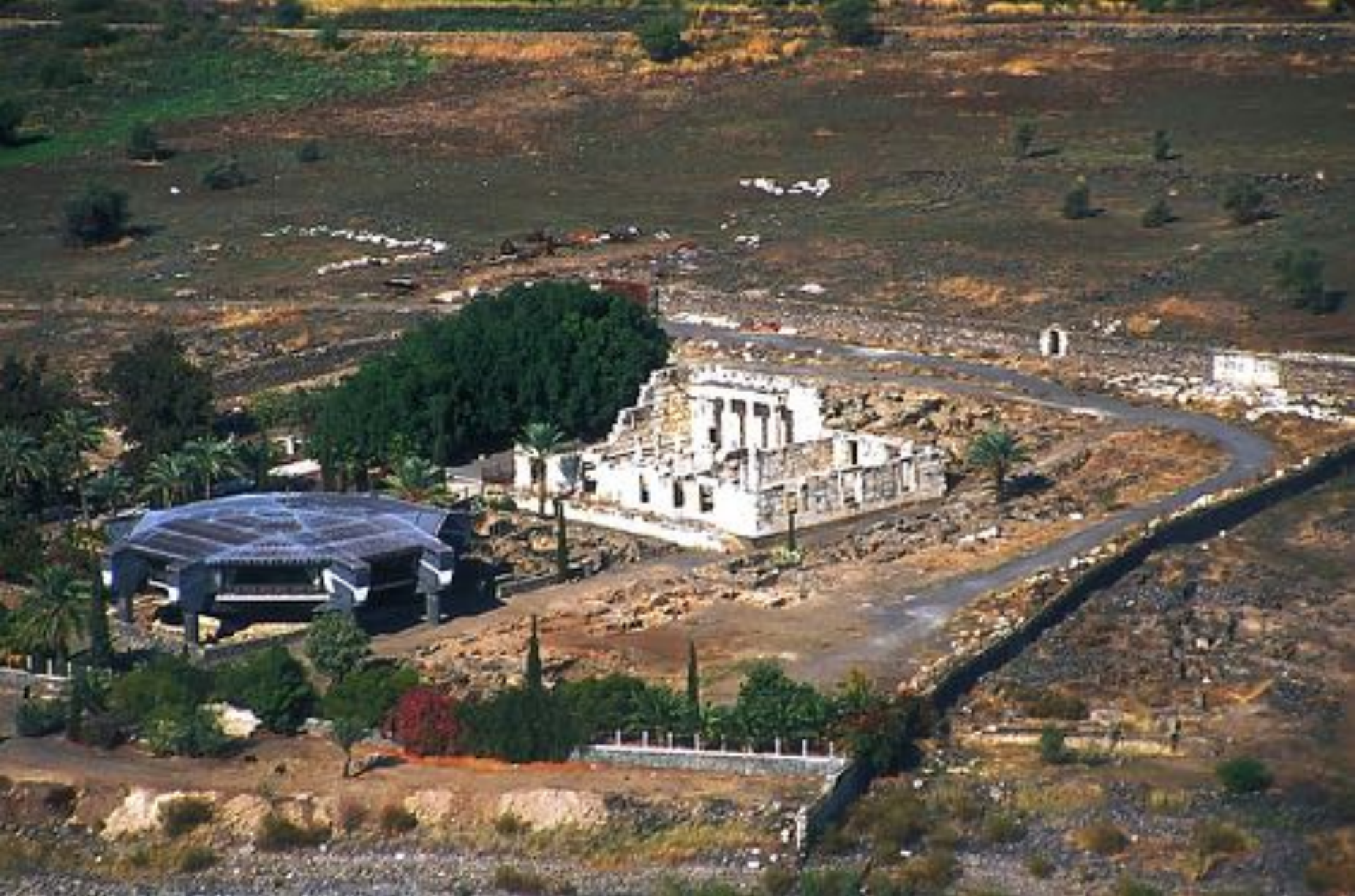
Capernaum aerial from southeast