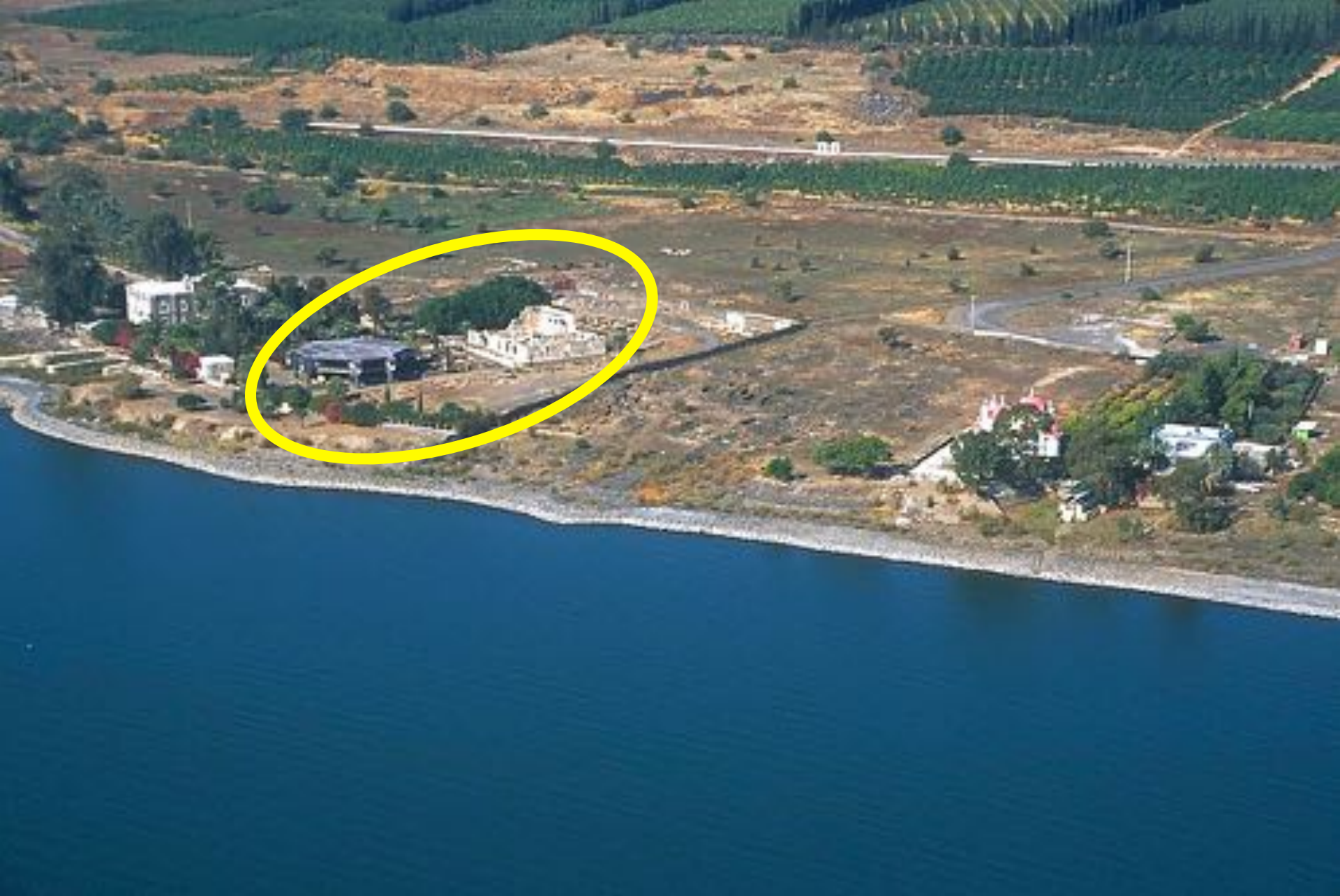
Capernaum aerial from southeast