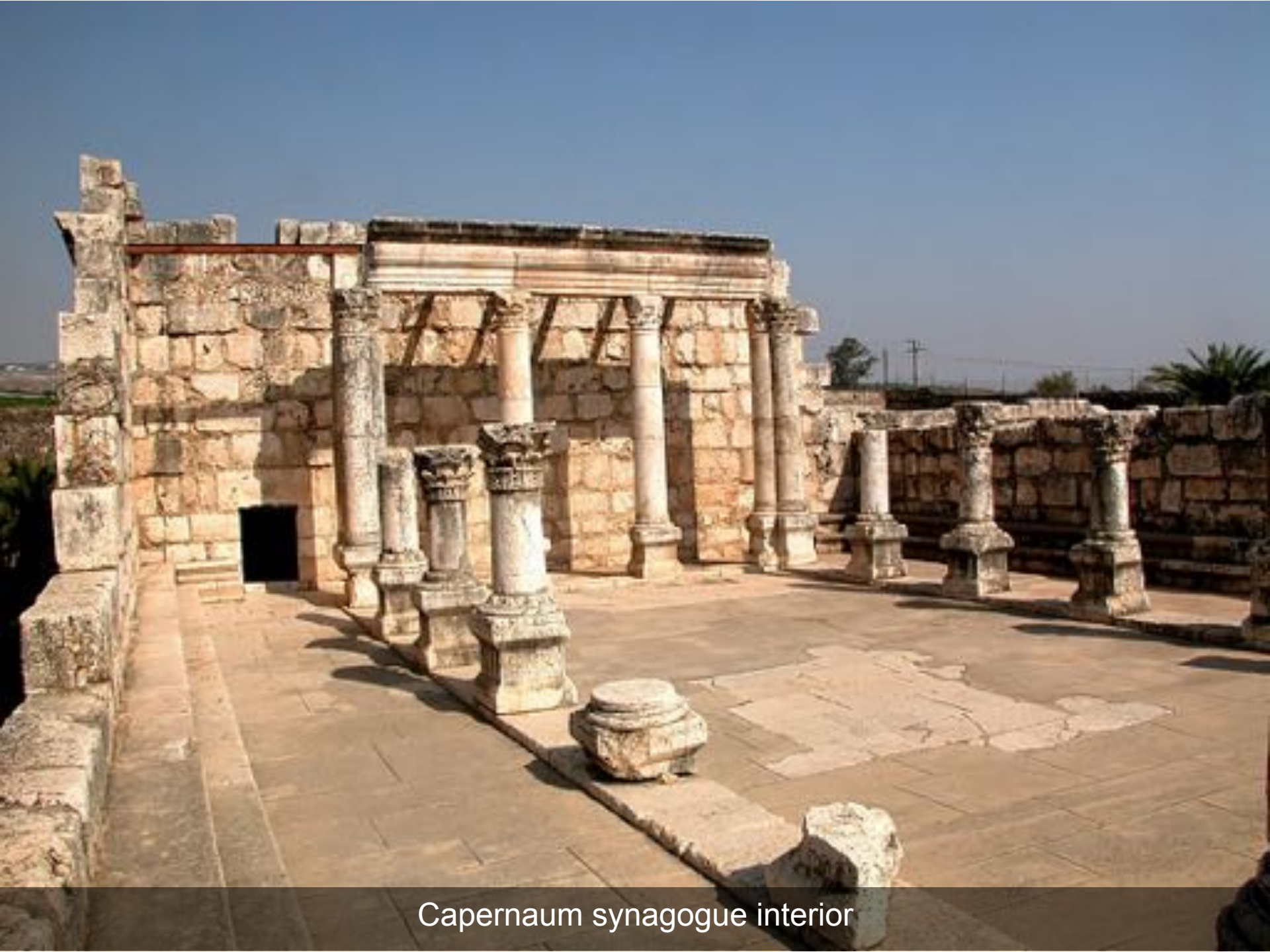
Capernaum synagogue interior