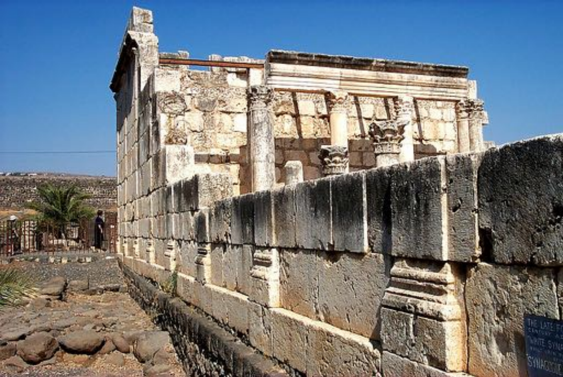
Capernaum synagogue with earlier basalt level