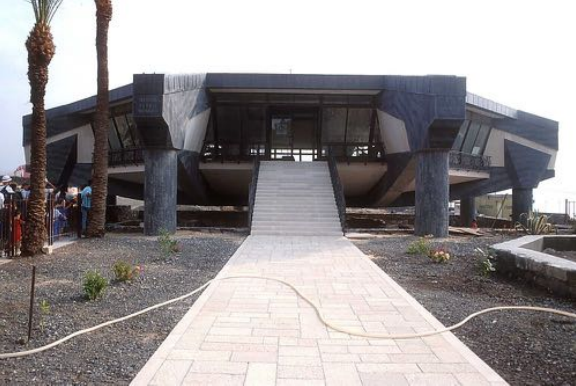
Capernaum Franciscan church over Peter's house