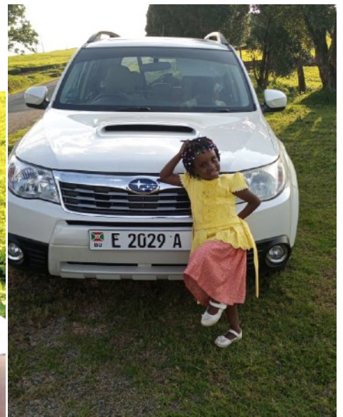
NEW CAR - THANK YOU FOR DONATING