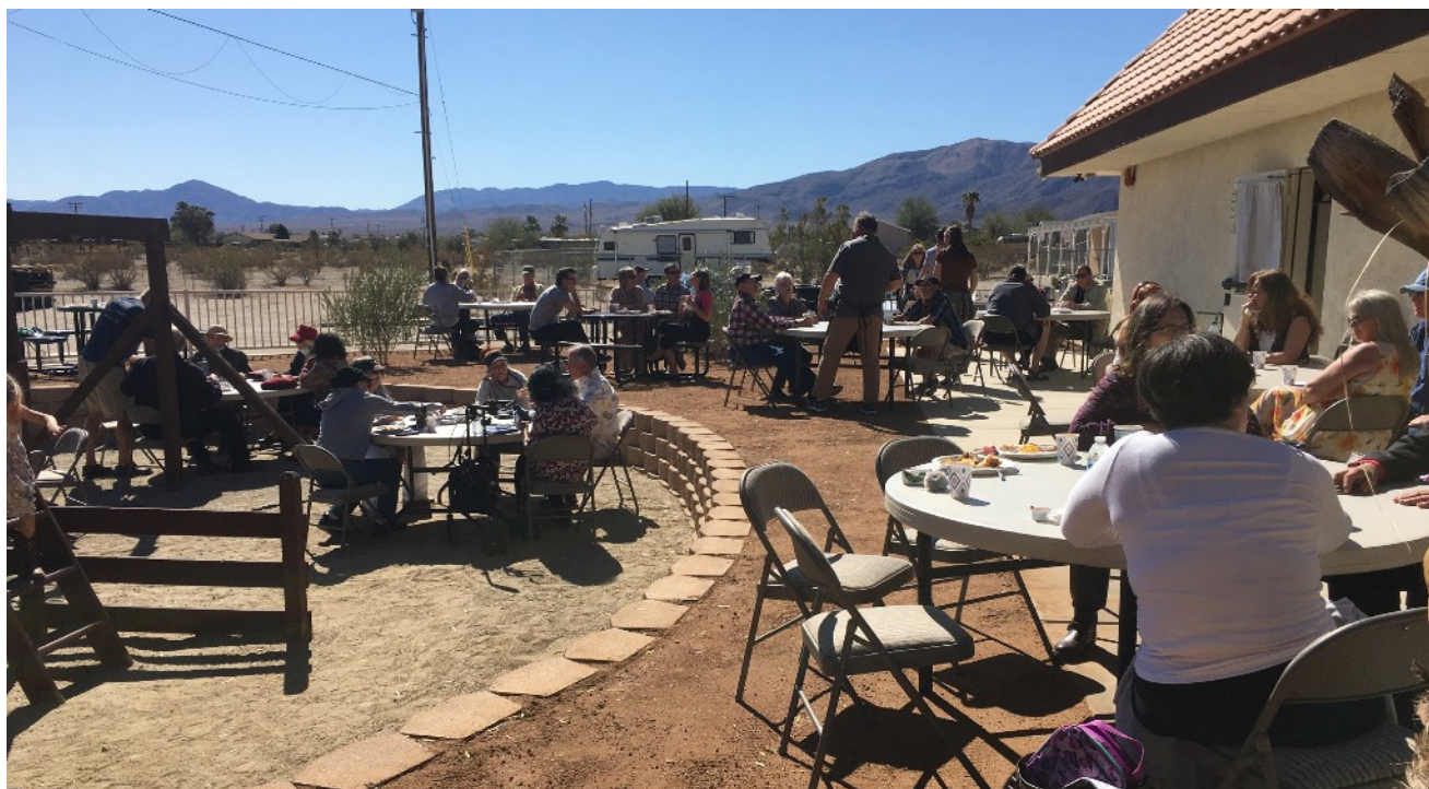
CHURCH BREAKFAST FOLLOWING SUNDAY SERVICE