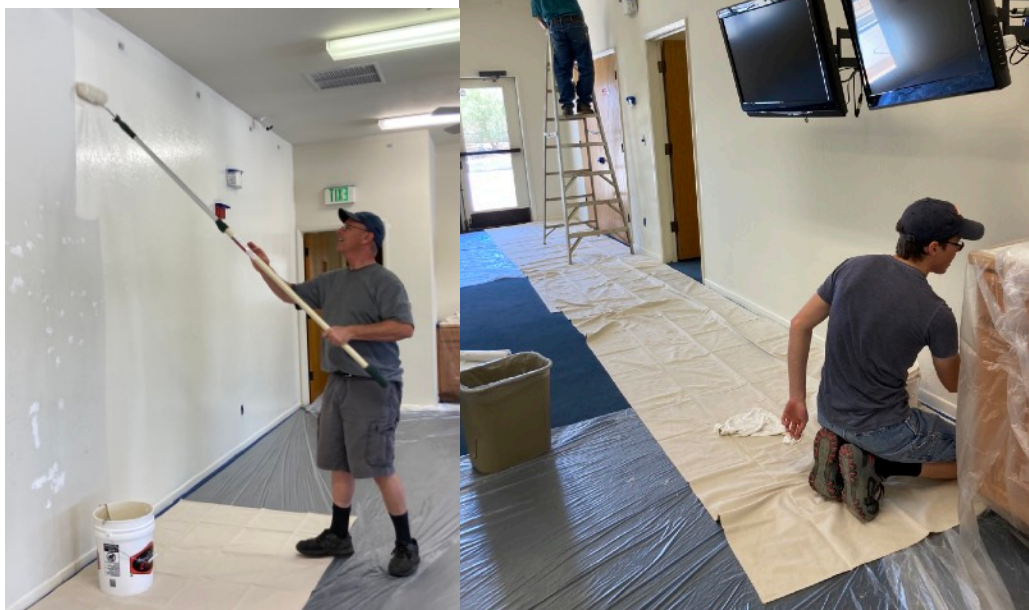
REPAINTING THE FELLOWSHIP HALL